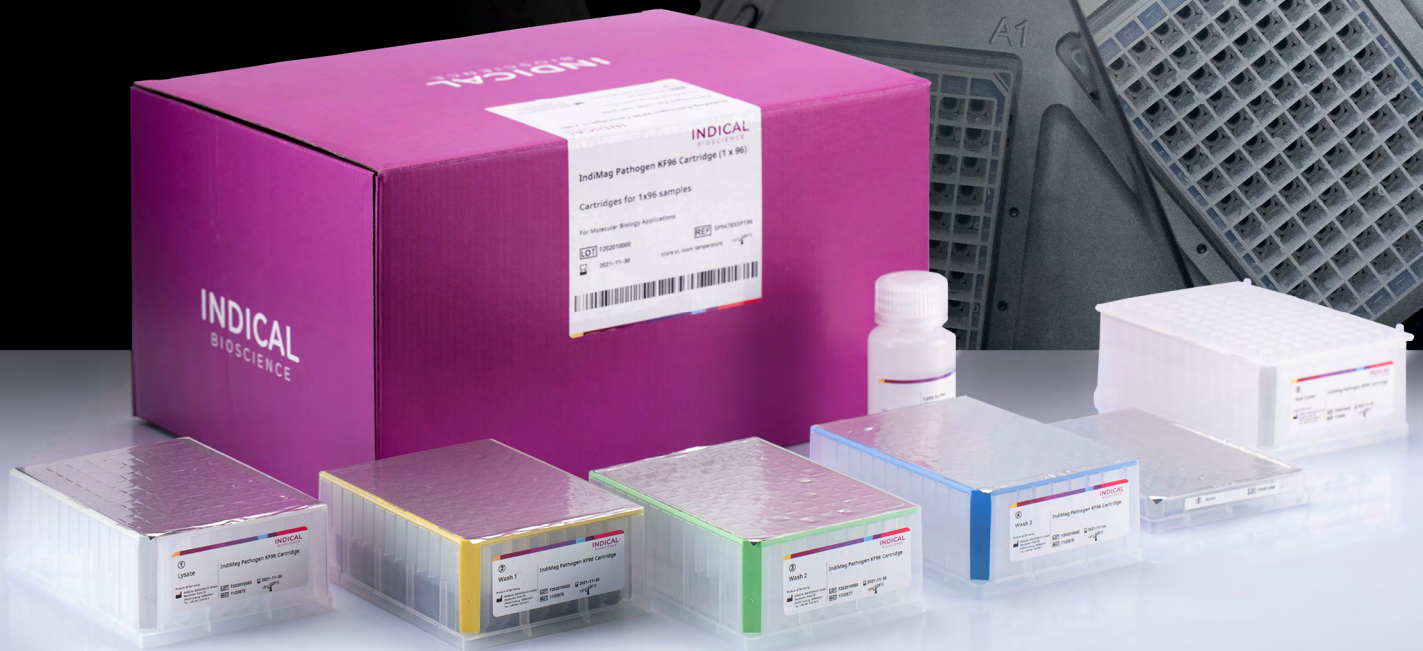
IndiMag Pathogen KF96 Cartridge (Cat. No.: SP947855P196)