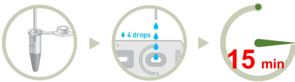
[Summary of Test Procedure]